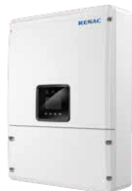
U1-Hybrid American Series ( U1-Hybrid-6.0/U1-Hybrid-7.0/U1-Hybrid-7.6/U1-Hybrid-8.6 )