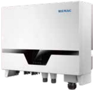
R3 Pro Series (NAC 20 - 33K)