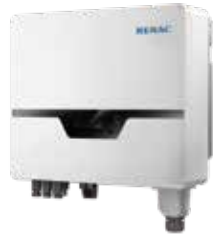
R1 Kiddy Series (NAC 4 - 8K)