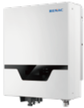
R1 Baby Series (NAC 1 - 3K)