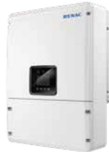
U1-Grid American Series ( U1-GRID-6.0/U1-GRID-7.0/U1-GRID-7.6/U1-GRID-8.6 )