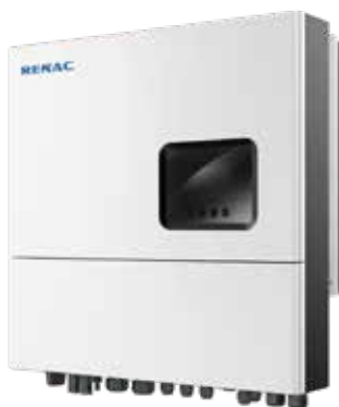
N1 Hybrid Series ( ESC3000-DS / ESC4000-DS / ESC5000-DS / ESC6000-DS )