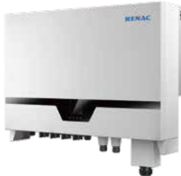
R3 Plus Series (NAC 50 - 80K)