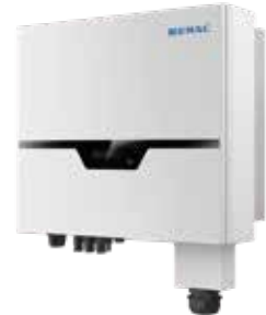
R3 Micro Series (NAC 6 - 15K)